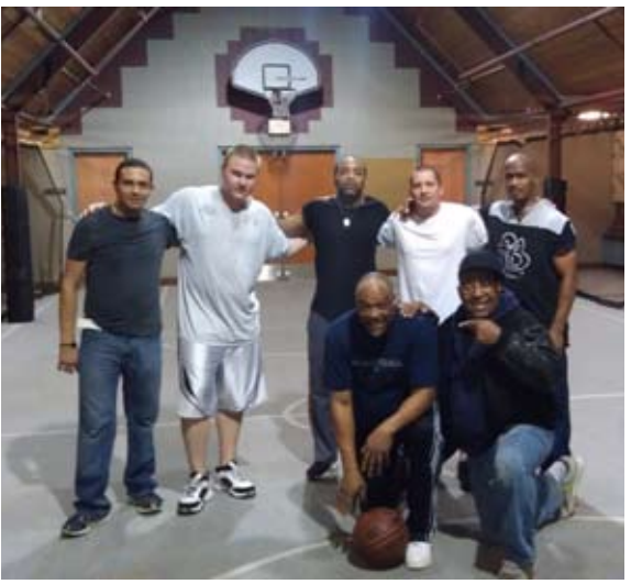
Group of guys from a local mission use our gym regularly to play basketball.

Elder Miller placed in nomination the following names for Congregational