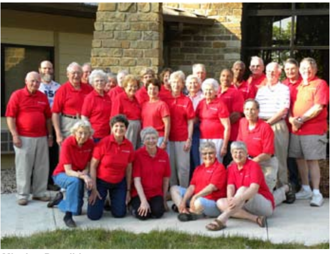
Mission Possible group.