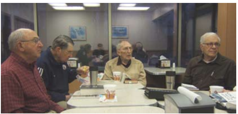
Men's Bible Study.

While some groups may complete their purposes and close, some plan to continue in 2013. We hope new groups will form and new leaders emerge in 2013.