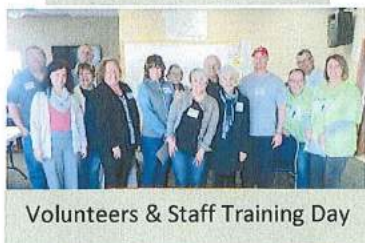
Volunteers & Staff Training Day