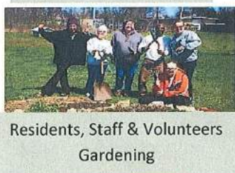
Residents, Staff & Volunteers Gardening