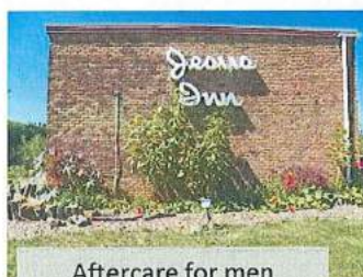
Aftercare for men