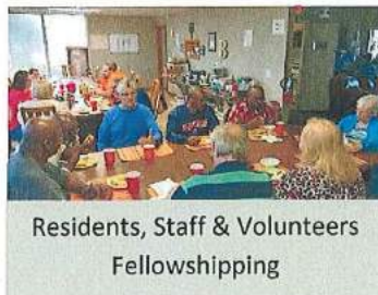
Residents, Staff & Volunteers Fellowshiping

Please contact us as soon as possible at 217-892-4044 or info@jesusisthewayprisonministries.org to reserve your seats. In your correspondence, we need to know how many will be attending with you as well as the names of those people. Seating is limited - Adults only.