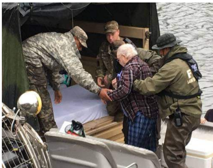
National Guard and State officials from Louisiana and Florida help evacuate a nursing home in Texas.