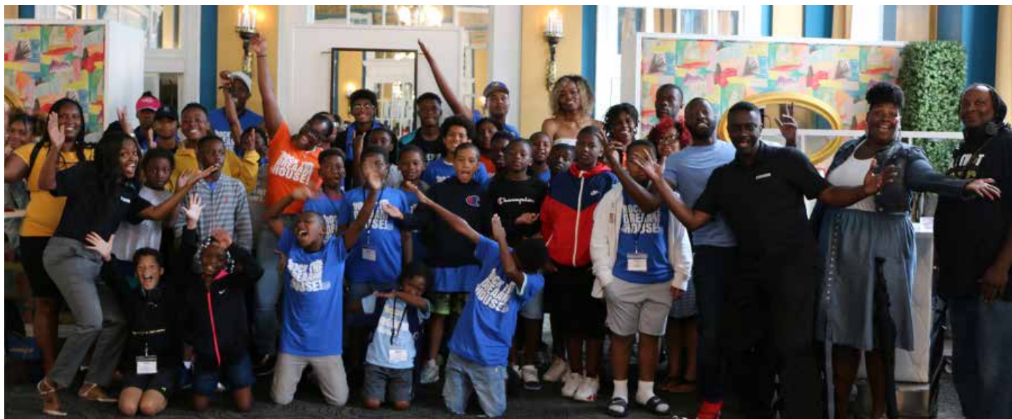
DREAM participants, parents and staff traveled from Champaign, Ill. to participate in Big Tent on August 2, 2019.