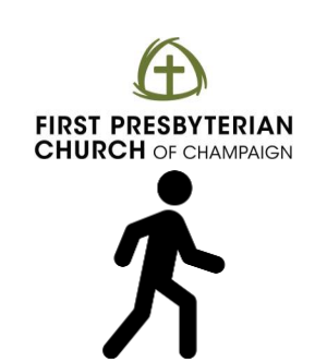
The Heart of Mission September 22, 2020

Environmental Stewardship participated in the Faith in Place Green Team Summit last week. They even won an award! I took a screen shot of the write up and photo from the Styrofoam collection day back in January.